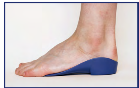
Outside of Left Foot

Gait Plates work by utilizing a semi-rigid shell that extends laterally beyond MTH's 4 & 5 to effectively alter the break of the ball of the foot during propulsion to encourage out-toeing of the limb at the hip. The littleSTEPS ® Gait Plate further addresses the foot pronation associated with in-toe gait by incorporating the features of a functional FO (deep heel cup, medial rearfoot posting and skive) to control subtalar joint pronation during contact and midstance phases of gait.