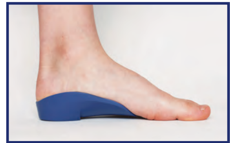
Inside Arch of Left Foot